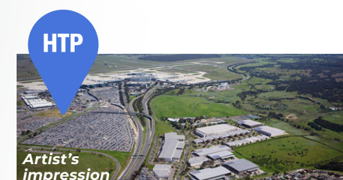
Haystone Tullamarine Precinct