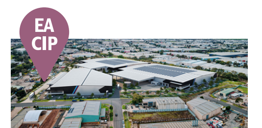
ESR Coolaroo Industry Park