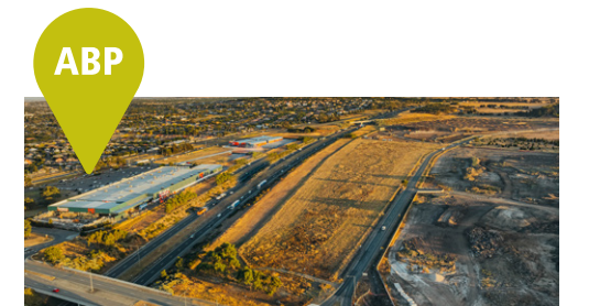
Amaroo Business Park