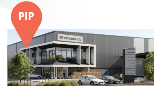
Pipeworks Industrial Park