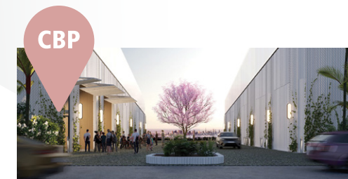
Cade Business Park