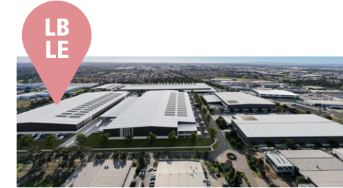
LOGOS Broadmeadows Logistics Estate