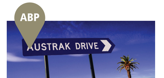
Austrak Business Park