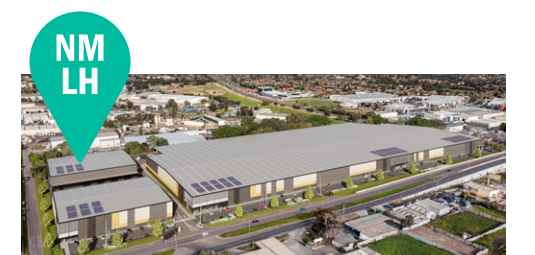
North Melbourne Logistics Hub