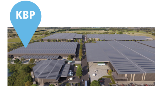
Kinetic Business Park