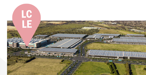
LOGOS Craigieburn Logistics Estate