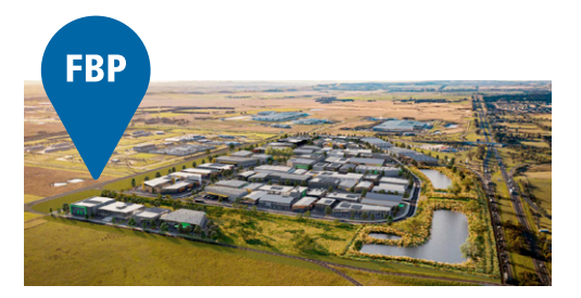
Fusion Business Park