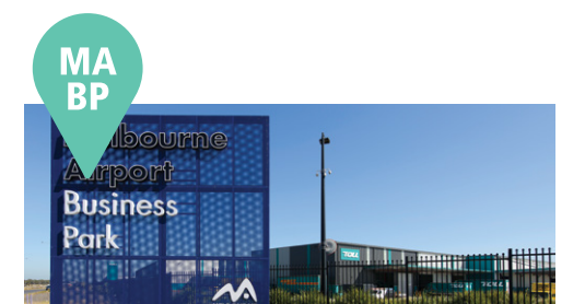
Melbourne Airport Business Park