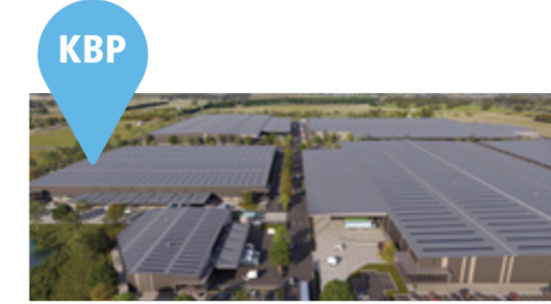
Kinetic Business Park