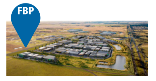
Fusion Business Park