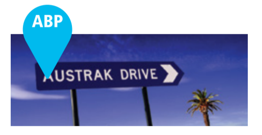
Somerton Business Park