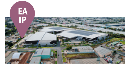
ESR Coolaroo Industry Park