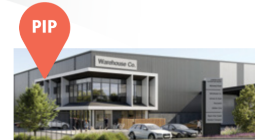
Pipeworks Industrial Park