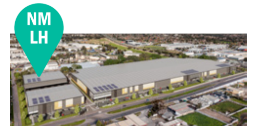
North Melbourne Logistics Hub