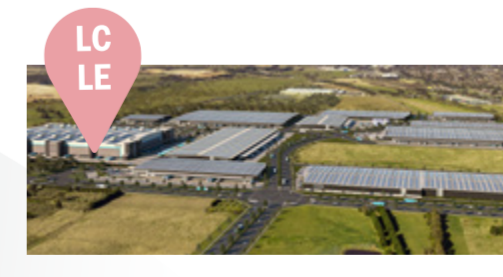
ESR Craigieburn Logistics Estate