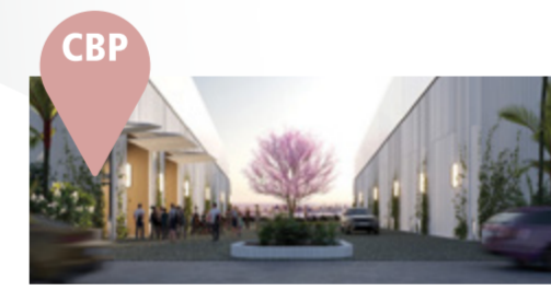
Cade Business Park