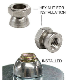
SHEAR NUT REFERENCE IMAGE