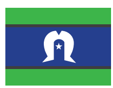
Torres Strait Islander Flag